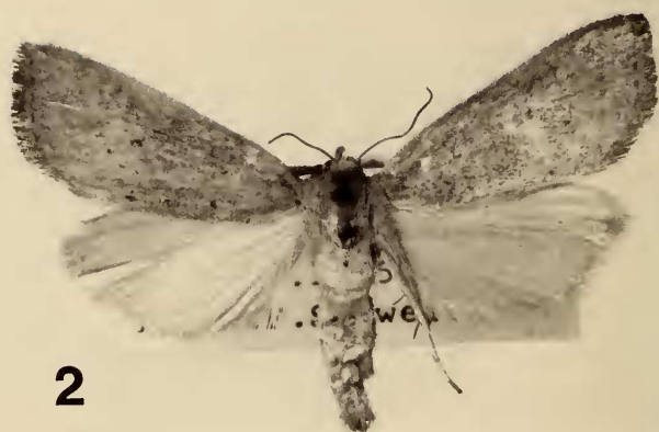
FIG. 2. Spartiniphaga carterae , allotype ♀.

Hindwing. Very pale with slight ochreous tinge in the males, nearly pure white in the females. Unmarked above, except for brown postmedian line on one ♂. Ventrally with prominent discal spot and fuscous along margins.